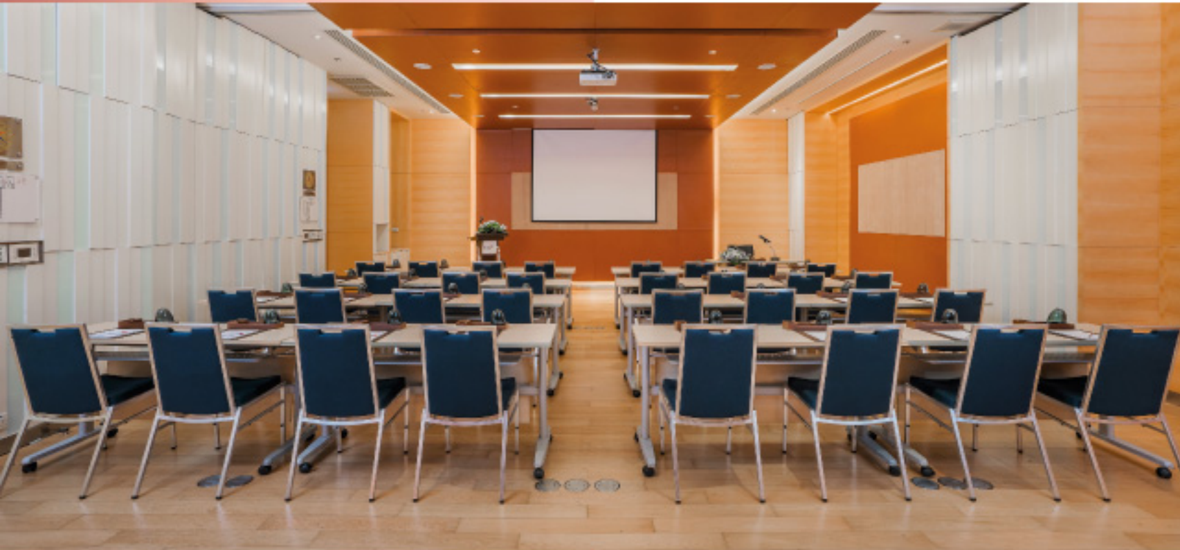
C l a s s r o o m