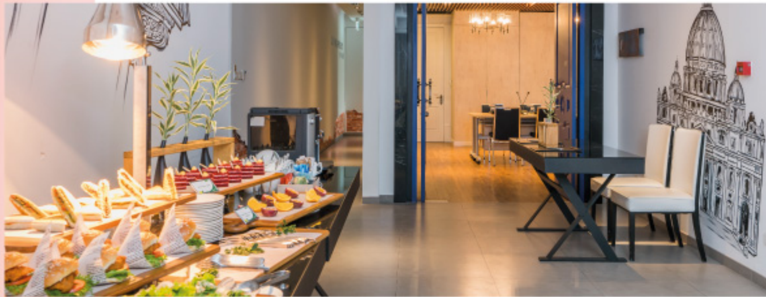
8 th Floor