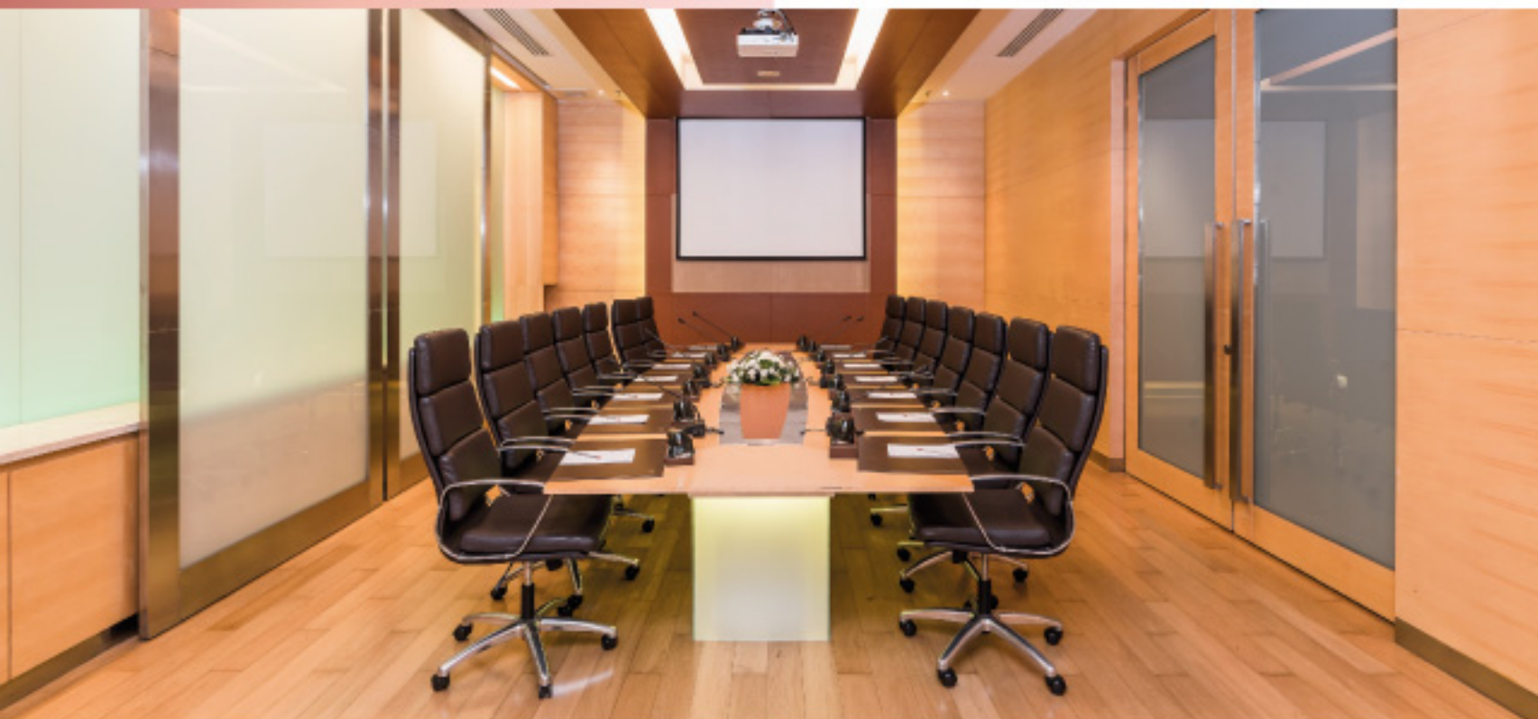
B o a r d r o o m