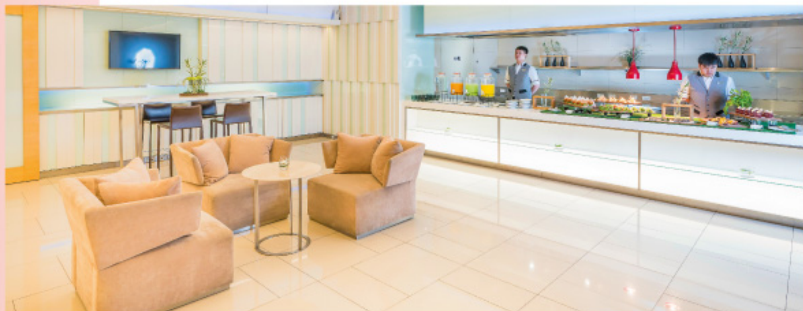
Below - Lobby